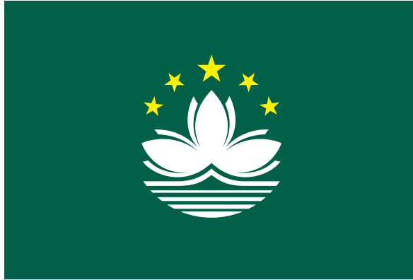
The Flag of the MSAR

The circular MSAR emblem consists of a narrow green border, a ring of characters on a white background, a green inner circle and elements including stars, a lotus flower, a bridge and seawater. The outer ring of characters lies between the narrow green border and the green inner circle. In the upper half of the ring of characters, 14 Traditional Chinese characters meaning “The Macao Special Administrative Region of the People’s Republic of China” are set in a standard traditional font, evenly distributed along the width of the arch. The lower portion of each character points to the centre of the emblem. In the lower half of the ring of characters, the Portuguese word “Macao” is printed in a standard font. The letters are evenly spaced, with the upper portion of each letter pointing to the centre of the emblem. Both the Chinese and Portuguese characters are distributed symmetrically on opposite sides of a vertical axis through the emblem. A white lotus flower with three petals is in the centre of the green inner circle. Above the lotus flower, five golden stars, of which the middle one is largest, radiate from the centre of the emblem. The lower points of the stars are directed at the centre of the emblem. Below the lotus flower, a white bridge and seawater are represented as green and white stripes.