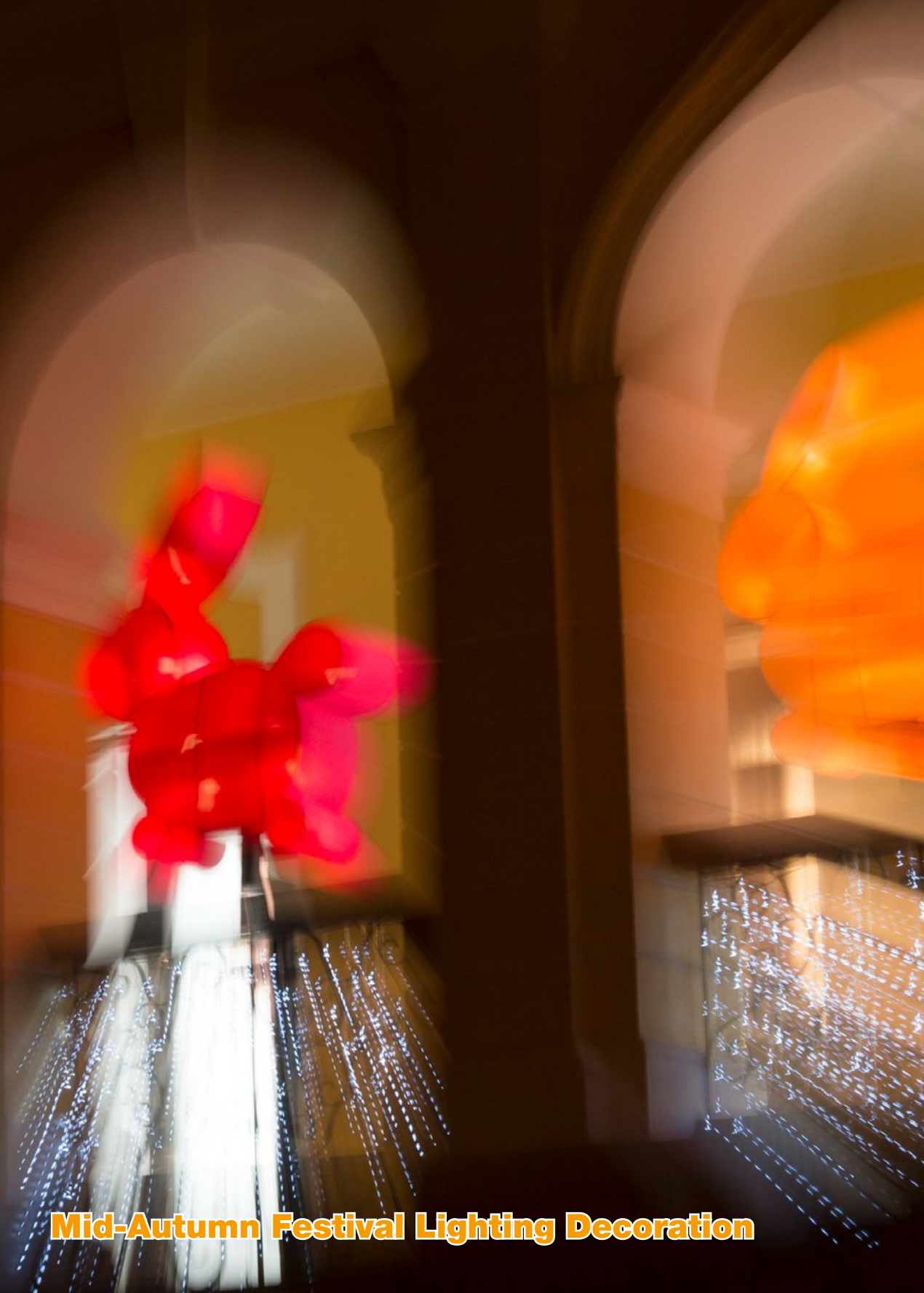
Mid-Autumn Festival Lighting Decoration